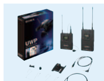
UWP-V1/V2 Wireless Microphone System