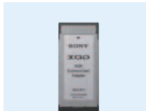
QDA-EX1 XQD Adaptor