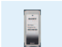
MEAD-SD01 SD Card Adaptor