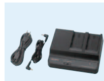
BC-U2 Battery Charger (2-slot)