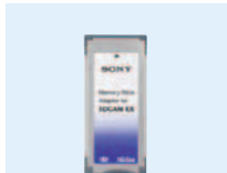
MEAD-MS01 Memory Stick Adaptor