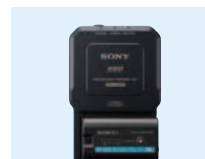
PHU-220R Professional Hard Disk Unit