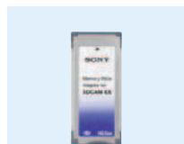
MEAD-MS01 Memory Stick Adaptor