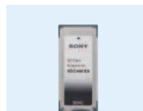
MEAD-SD01 SD Card Adaptor