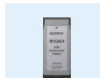
QDA-EX1 XQD Adaptor