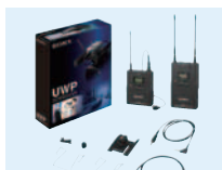
UWP-V1/V2 Wireless Microphone System